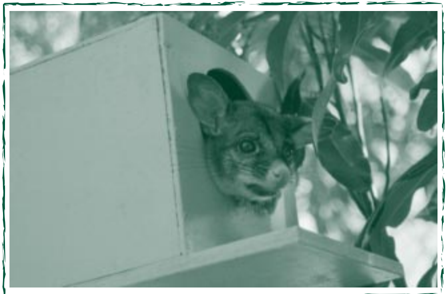
Possums regularly make use of nest boxes erected on the Douglas' Land for Wildlife property in south-east Queensland.

While artificial nest boxes have been a success overseas, it is only recently that they have used as a valid conservation tool in Australia. Nest boxes in the Herbert River Catchment in north Queensland are being used to encourage barking owls, barn owls and masked owls to breed. The objective is to reduce the use of baits to control sugar cane rats. Nest boxes have also been used in threatened species recovery programs in other parts of Australia, such as the red-tailed phascogale in Western Australia.