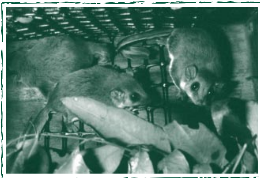
One nest box may be used by several species at different times. These feathertail gliders made use of bat boxes in south-east Queensland.

The inside diameter, entrance above the floor, height above the ground and placement should be considered when constructing and hanging a nest box. Entrance holes should be just large enough for the animal to enter. For more information about commercially available nest boxes search Australian internet sites for "nest boxes".